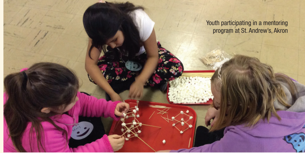
Youth participating in a mentoring program at St. Andrew's, Akron

Dollars received in one calendar year are expended the following year; for example, gifts received in 2016 fund programs and ministries in 2017.